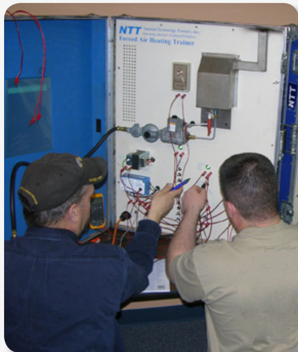
Participants learn how to troubleshoot safely based on circuits being open and closed.