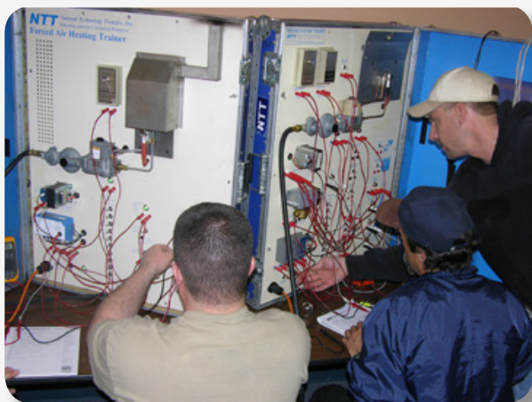
Participants learn the different types of troubleshooting tests: current, frequency, resistance, continuity, capacitor and diode testing.